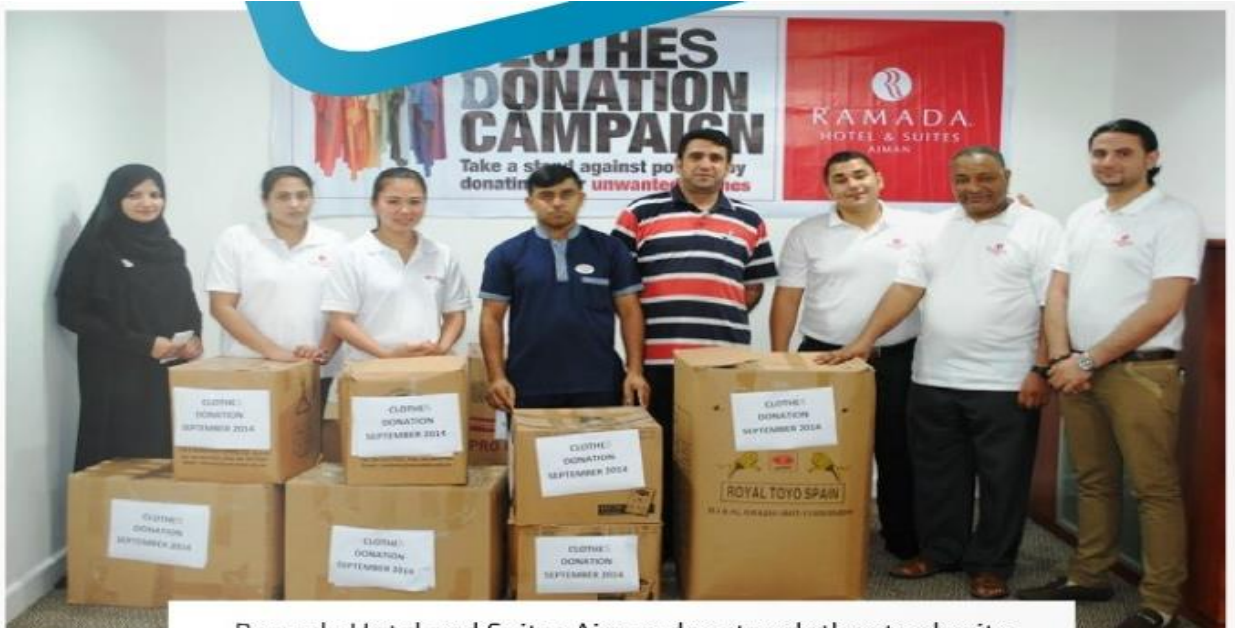
Ramada Hotel and Suites Ajman donates clothes to charity