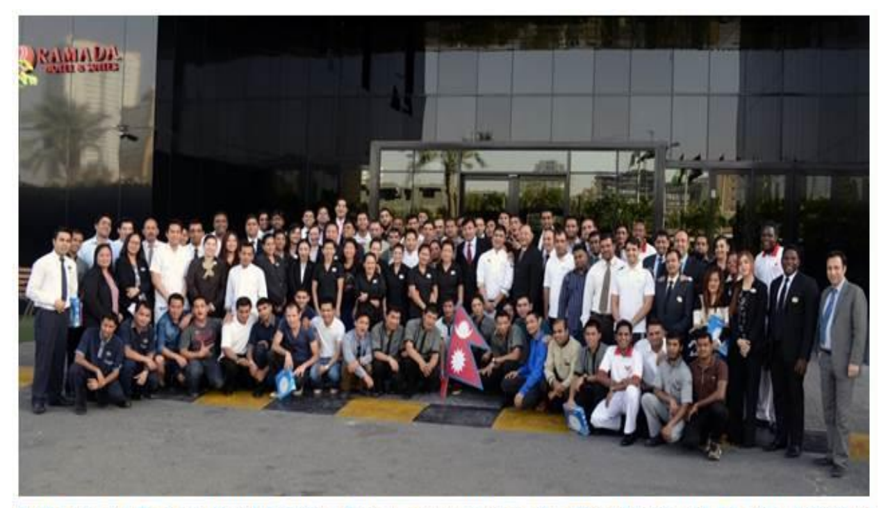
In the photo: Ramada Hotel & Suites Ajman, recognized as the "Best Hotel with Charity Initiatives 2012" by the Wyndham Hotel Group and Ramada Beach Hotel Ajman were able to collect a total amount of Aed 50,000 from their Management and team.